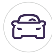
Left hand drive